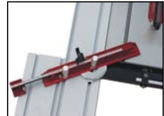
Angled Cuts with Slider