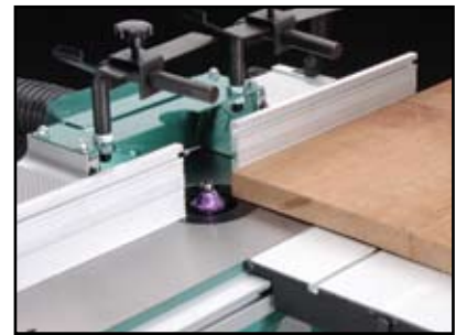
Easy Stock Feeding